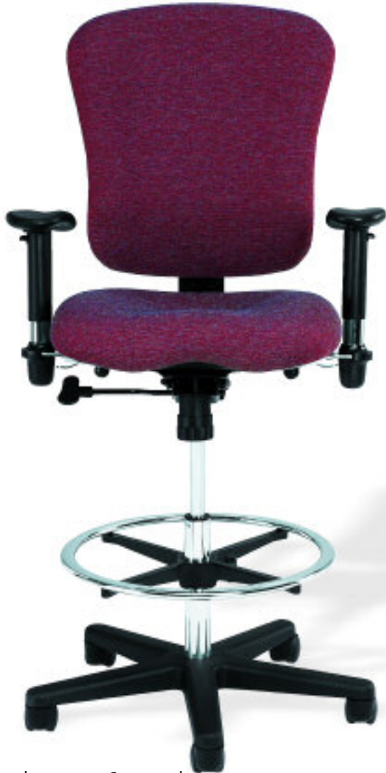
I t h a c a S t o o l

Ithaca is available as a task model, sled base or stool. All Ithaca seating features thick, plush, molded seat and back foam and a variety of ergonomic adjustments.