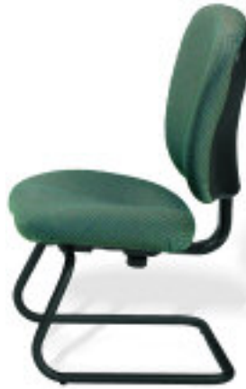
Sled Base Chair