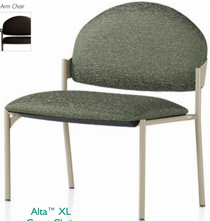
Alta™ XL Guest Chair

Arm or Armless Chair Available APPROVED AS A 24/7 CHAIR