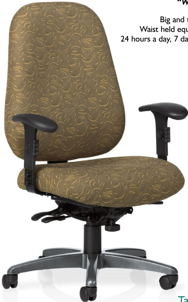
Pilot™ Task Seating

Big and tall users will appreciate the expansive seat design. Waist held equipment is no longer cumbersome when you take a seat. 24 hours a day, 7 days a week, our oversized seating options are working for you.