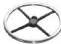
foot ring #PFTG20TL