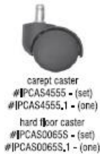
castor #PCAS4555 - (set) #PCAS4555,1 - (one) hard floor #PCAS0065S - (set) #PCAS0065S,1 - (one)