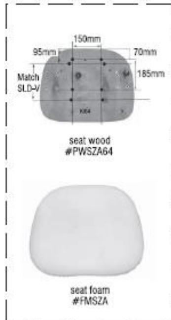
seat wood #PWSZA64